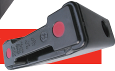
RED SPOT RS63H

And in 32A we're offering Red Spot 'Safeclip' and Camaster 'Safeloc' fuseholders – five different configurations.