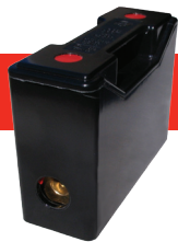
RED SPOT RS100H

Red Spot, made in the UK – 63A, 100A, 200A, 400A. Ten different Red Spot options, including some offered in white. See the Bussmann section on nzinsulators.co.nz for the product schedule.