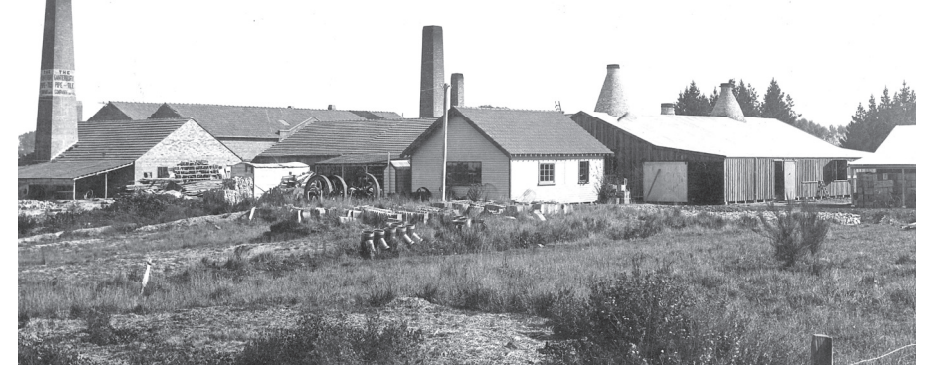
New Zealand Insulators - since 1924

Across the 80s and 90s NZI had some good years, and was split into three divisions with the Low Voltage division having its own site in Ashburton. The business at peak employed more than 400 people, and many staff stayed with NZI for their entire working lives.