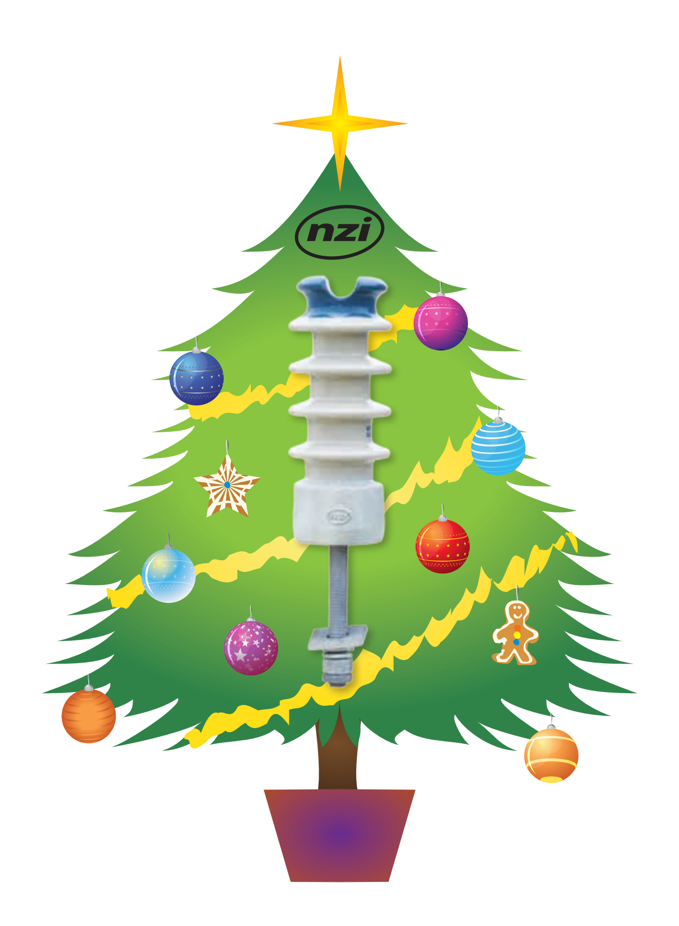
Merry Christmas 2014