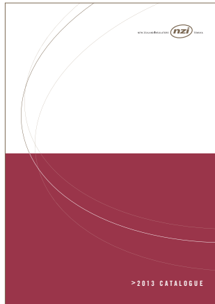
2013 NZI Catalogue NZI's complete product range Release date – 14/1/13 96 pages, new brands & range extensions